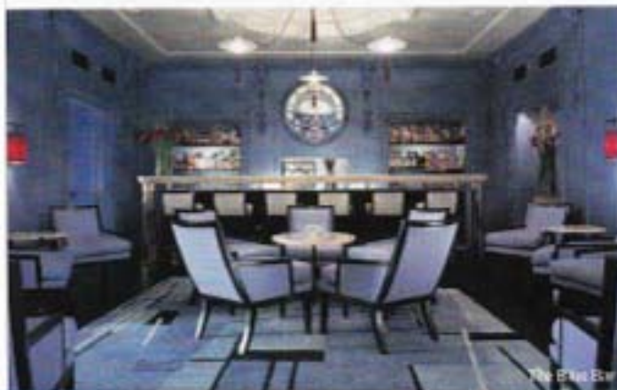
The Hudson Bar

The Arctic Icebar, Helsinki Chill out: Everything in this igloo-like bar is made entirely of ice — including the slippery floor. Throw on a reindeer skin and then sip some vodka from an ice cup. Enter from restaurant La Bodega, Ylipöistiekatu 5; 011-358-9-278-1855; www.arcticicebar.fi