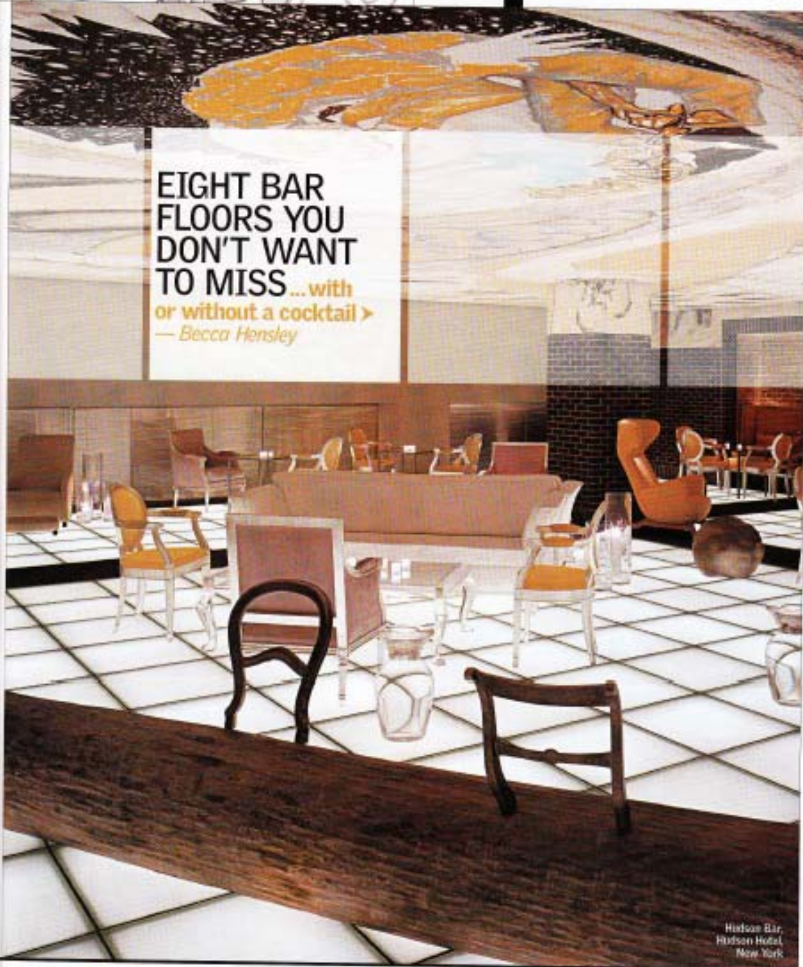
Hudson Bar, Hudson Hotel, New York