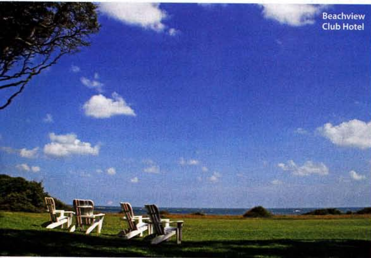
Beachview Club Hotel