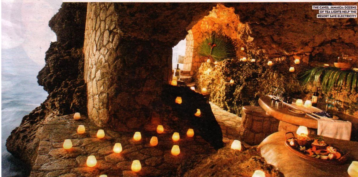
THE CAVES, JAMAICA: DOZENS OF TEA LIGHTS HELP THE RESORT SAVE ELECTRICITY

RELAX AND RECHARGE WITH A SLICE OF WINTER SUN