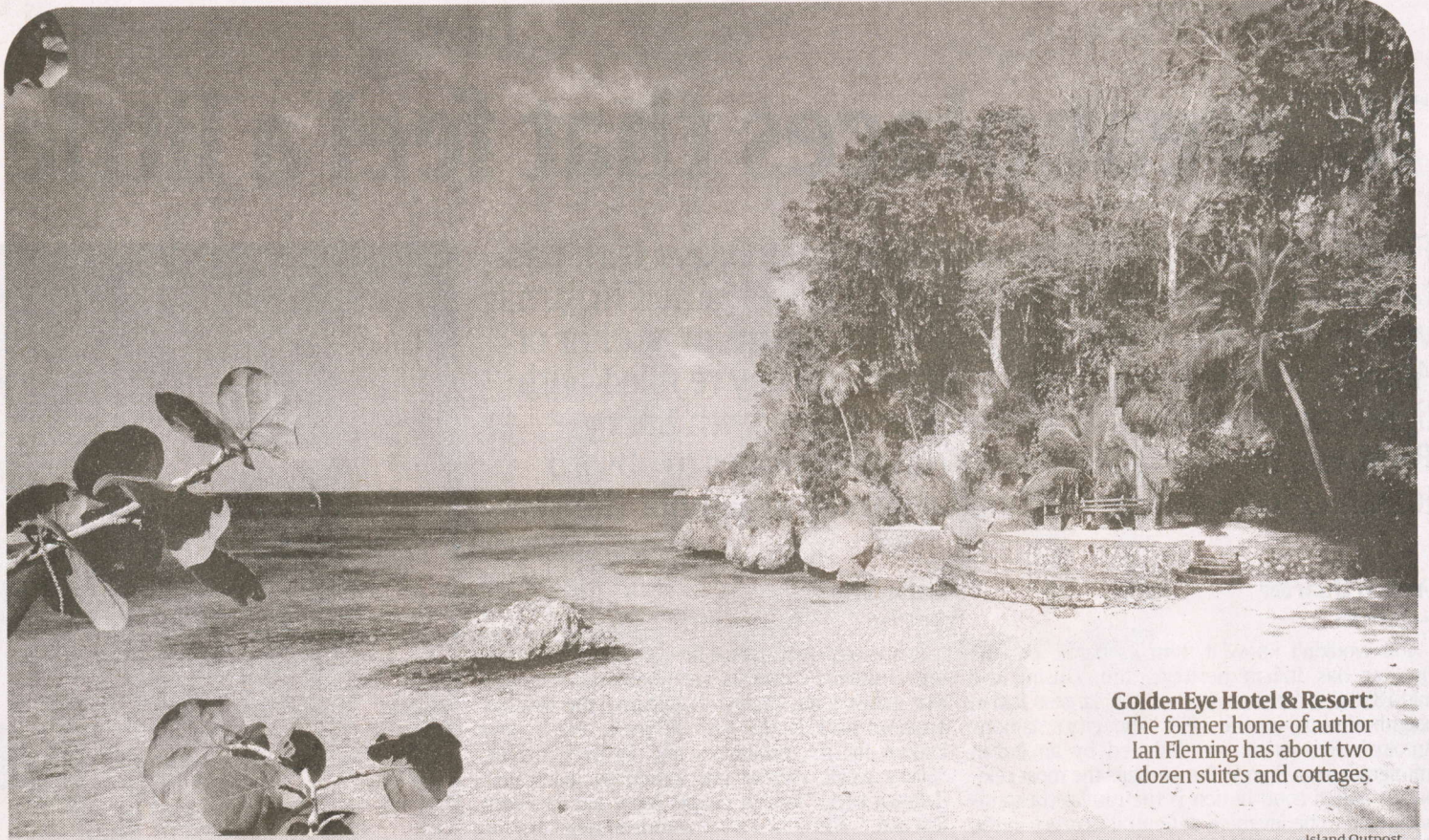
GoldenEye Hotel & Resort: The former home of author Ian Fleming has about two dozen suites and cottages.